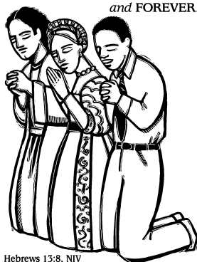
Hebrews 13:8, NIV

JESUS CHRIST is the same YESTERDAY and TODAY and FOREVER.