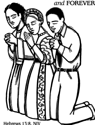
Hebrews 13:8, NIV

JESUS CHRIST is the same YESTERDAY and TODAY and FOREVER.